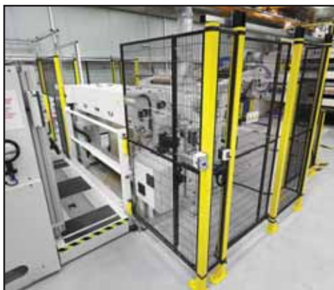
The Plasma3™ treater generates long lasting dyne levels that allow APTIV™ film to be converted long after extrusion.

The intense level of treatment provided by plasma solved those problems and helped customers with down-line processes. "PEEK is a very chemically resistant material, and as such it's very difficult to get materials to key to it," explains Percy.