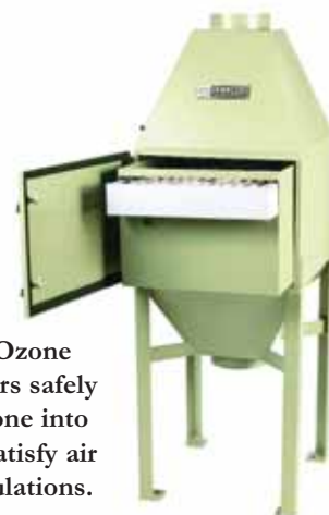
Enercon Ozone Decomposers safely convert ozone into oxygen to satisfy air quality regulations.

The ozone decomposer converts ozone (O 3 ) into Oxygen (O 2 ). The unit consists of a particle filter, prefilter material, and oxide catalyst bed that reduces an input ozone level of up to 150 PPM to less than 0.1 PPM at the designated flow rate.