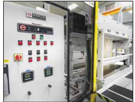
Enercon's Plasma3™ system at the Victrex U.K. facility provides long lasting treatment levels.

Key to the success of the APTIV film product, says Percy, is an off-line, post-extrusion Enercon Plasma3™ surface