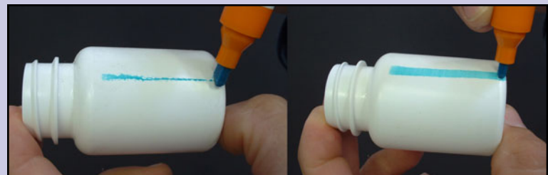
Incorrect Dyne Level

32, 35, 38, 41, 44, and 48 level pen. Contact us today at enews@enerconind.com or (262)255-6070 and ask us about our low introductory price available for a limited time only.