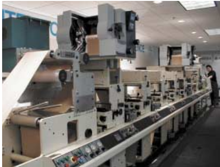
The 4150 Mark Andy press located in Akzo Nobel Inks' Center for Technical Excellence is equipped with an Enercon TL Max II Two-Sided Treater.

For more information on the seminar schedule, contact the Center at 612-551-1936.